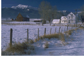
There are no miles between sisters.

granddaughters, daughters-in-law, sisters, sisters-in-law, mothers, grandmothers, aunts, nieces, cousins, and extended family, all bless our life!