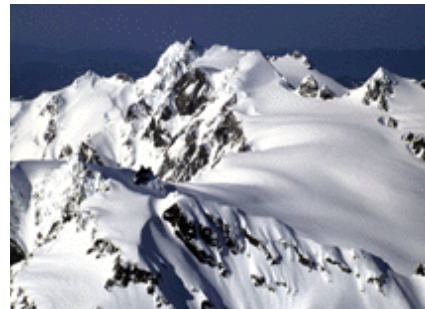
The beauty that surrounds us can also sadden us.

*Increase your carbohydrate intake to in-