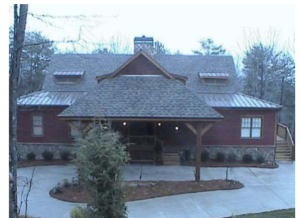
Airing on Sunday, March 4, 2007 at 8:00 PM CST