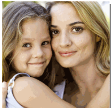
Dedicate May to Legacies