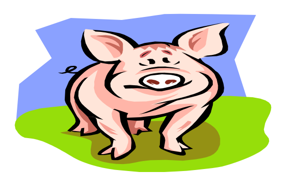
We're missing stories and hope to get them one day!