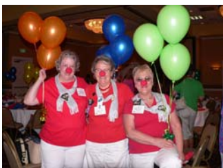
Girls Just Want to Have Fun!